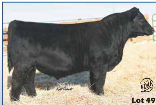
V D A R Cedar Butte 3568

AAA CE BW WW YW M 19131254 7 +2.3 65 114 26