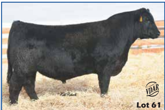
VDAR Winston 4118

AAA CE BW WW YW M 19085117 7 +9 52 89 26