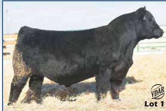
V D A R Sonny Boy 3288

AAA CE BW WW YW M 19136570 4 +2.2 66 119 22