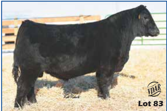
VDAR Cedar Wind 4628

AAA CE BW WW YW M 19085044 13 +2 53 93 29