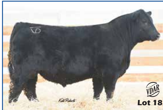
V D A R Cedar Wind 3228

AAA CE BW WW YW M 19169805 11 -1.0 63 117 24