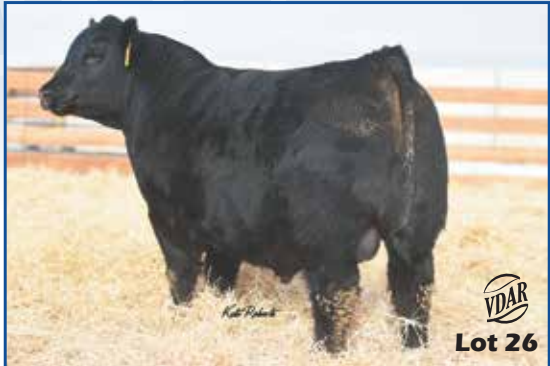
VDAR Showdown 4188

AAA CE BW WW YW M 19085034 2 +1.8 53 95 24