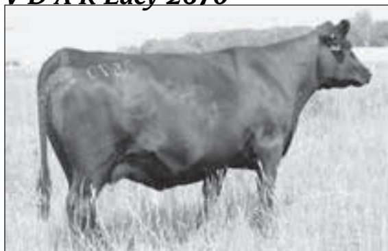
Dam of Lot 77

78 V D A R ALTITUDE 3728 372 19131263 02/12/2018 CONNEALY CAPITALIST 028# VDAR WULFFS ALTITUDE 423 WULFFS ERICA 681 V D A R GAME DAY 7060 V D A R MISS WIX 3349 V D A R MISS WIX 0309