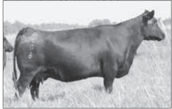
Dam of Lot 41