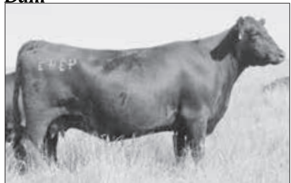
Dam of Lot 52