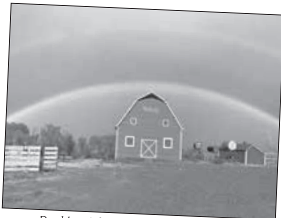
Double rainbows...double blessings!