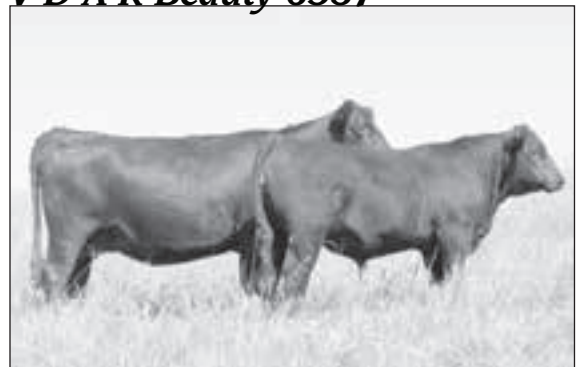
Dam of Lot 20