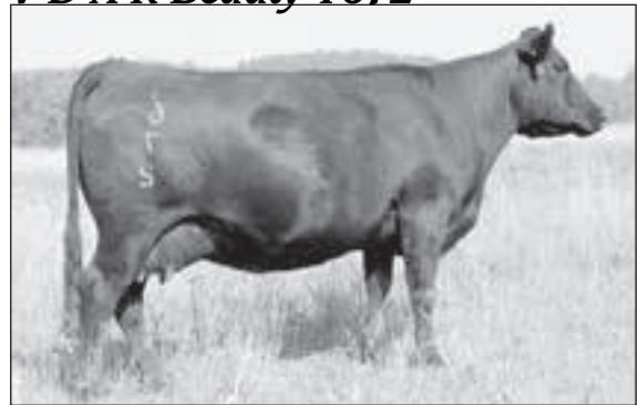
Dam of Lot 16