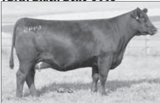
Dam of Lot 44