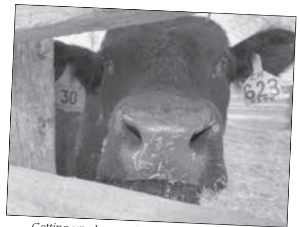
Getting up close and personal with VDAR bulls is always a mooving experience!