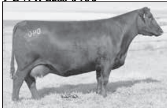
Dam of Lot 114