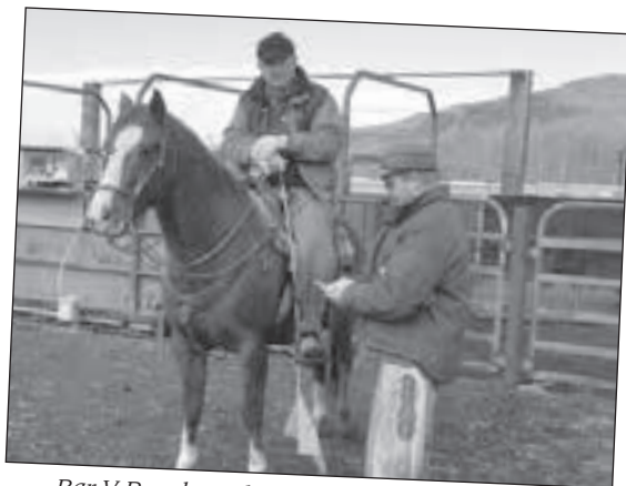
Bar V Ranch cattle bosses, Pendleton, OR.