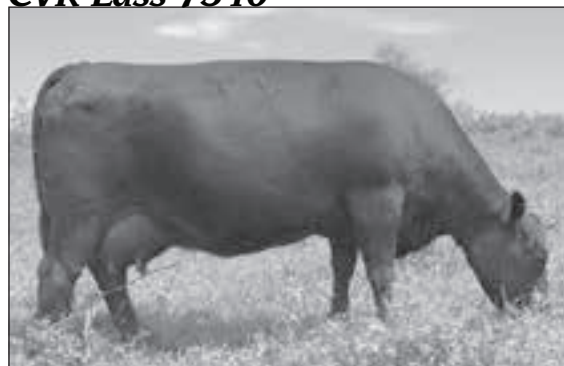
Dam of Lots 3, 10, 12, 115 & 118