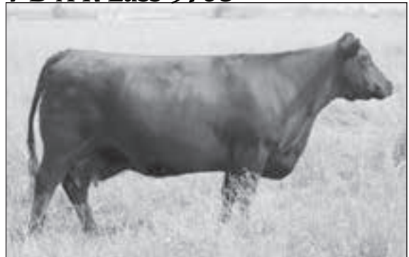
Dam of Lot 29