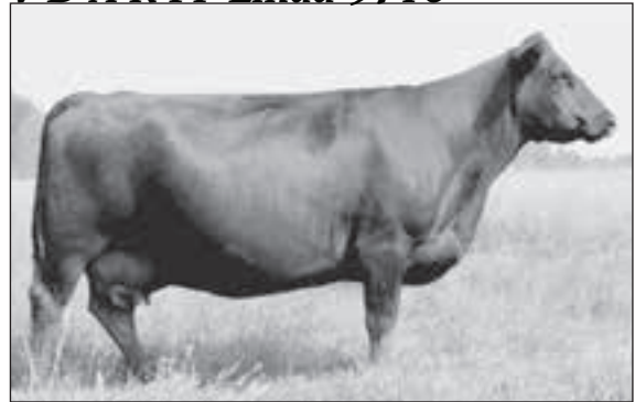
Dam of Lot 5