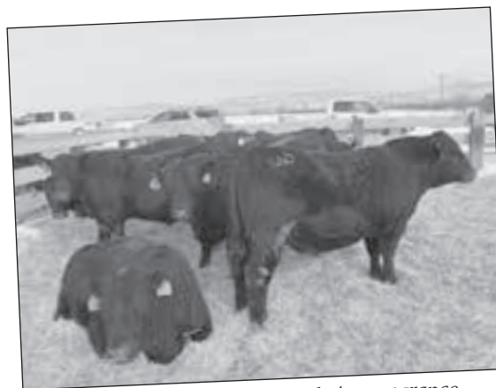
Just relaxing before they make their appearance.

Videos available on YouTube at 2019 VDAR Cattleman's Advantage Bull Sale!