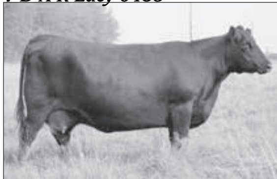
Dam of Lot 31